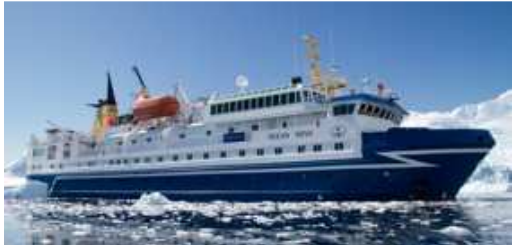
Vessel OCEAN NOVA

The Ocean Nova is a modern and comfortable vessel. She was built in Denmark in 1992 to sail the ice-choked waters of Greenland, and her ice-strengthened hull is ideally suited for expedition travel in Antarctica. The Ocean Nova's has capacity for 68 passengers accommodated in comfortable outside cabins, all with private facilities, including dedicated single, twin and triple cabins.